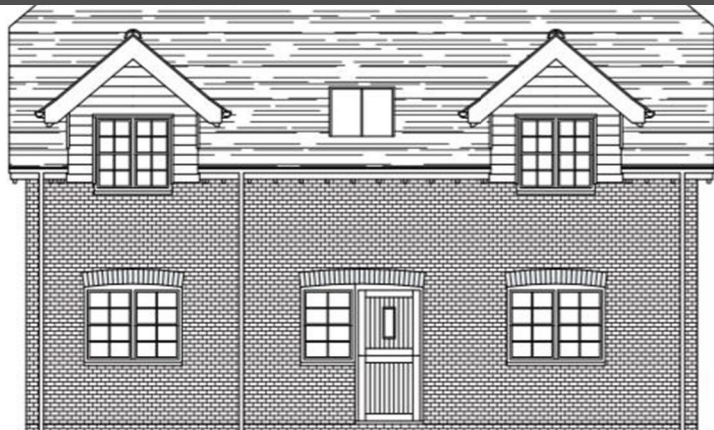
General Arrangement Front Elevation 150 @ A1 Scale